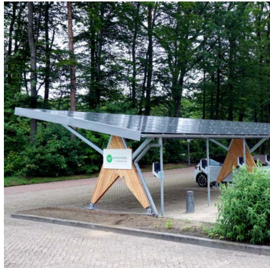
Solar carport test-site at the University of Twente

of "Vriendenerf" ("Friends' Garden"), where solar PV and EVs are already available. The inhabitants in these sites have well insulated houses with heat pumps, giving room to utilize untapped flexibility. As these citizens are more senior, the group will be largely different from the tech-savvy users at the University of Twente, which brings additional challenges, including, how to make the systems even more intuitive, comfortable, and less intrusive to the end users. Nevertheless, these citizens are all also very aware that we need to change behaviours to keep our planet habitable for the coming generations and are therefore ready to cooperate with us! ■