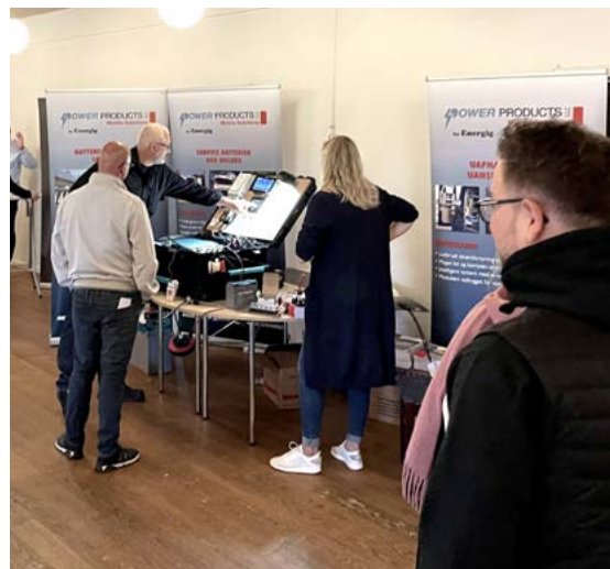
Energy Fair in Stjær in September 2021