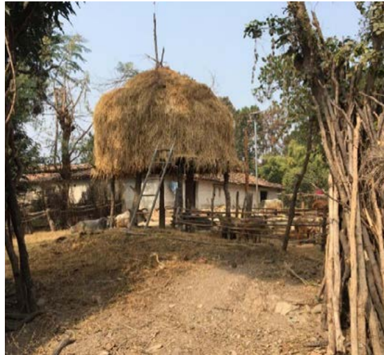
Case 1: BARUBEDA VILLAGE, which aims at becoming a carbon neutral "islanded" energy community