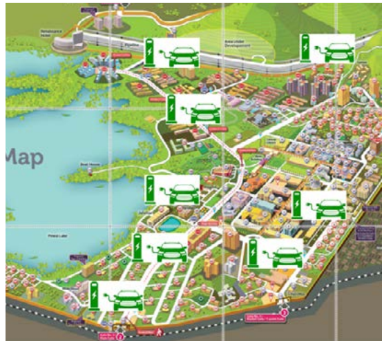
Case 3: Solar powered building in IIT BOMBAY CAMPUS IN MUMBAI (left) and a campus map with planned EV-chargers localization (right)