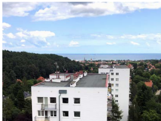
View from the roof of one of the blocks of flats at the Mickiewicz Housing Estate in Sopot

What is actually planned to be realised within SUSTENANCE for this local community? The dedicated, integrated energy system combining