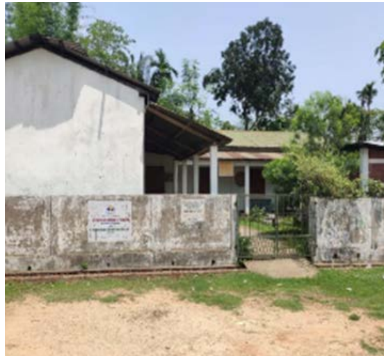
Case 2: BORAKHAI VILLAGE, which aims at delivering smart clusters based on local energy systems powered by renewables