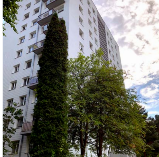
View on one of the blocks of flats in the Mickiewicz Housing Association in Sopot

All Polish members of the SUSTENANCE team are strong actors in the local energy market and will actively participate in demo activities and support the WSM Board in this project. IMP PAN acts as the coordinator, ENERGOPERATOR S.A. is the local energy distributor, who will modernise the local transformer station and install smart meters, STAY-ON ENERGY MANAGEMENT will pioneer the design and management of energy storage systems, and KEZO